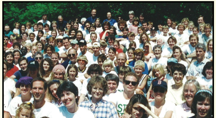
Alumni pose for a group photo at the 60th reunion in September of 1995.

The date for the 75th reunion of Gwynn Valley Camp has been set for August 20-22, 2010. We are excited to begin the planning process and will be sure to keep you updated through our website, as well as via mail and email regarding the details. Alumni: Please visit www.gwynnvalley.com and complete the short Alumni Update Form to ensure we have your most recent contact information, especially your email address.